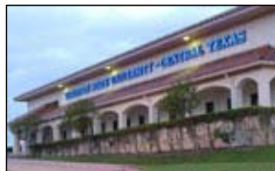
TAMU-CT Administration Building