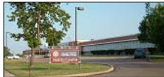
TAMU-CT North Campus

Library Department Texas A & M University- Central Texas