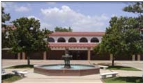
Oveta Culp Hobby Memorial Library